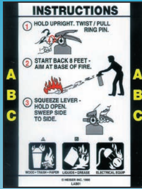
LAB01 ABC with Nozzle

Cabinets, Service Supplies, Tags & Labels