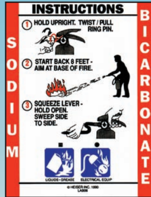
LAB06 BC with Hose