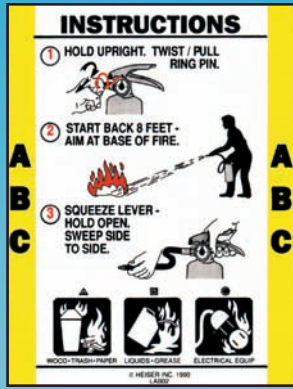
LAB02 ABC with Hose