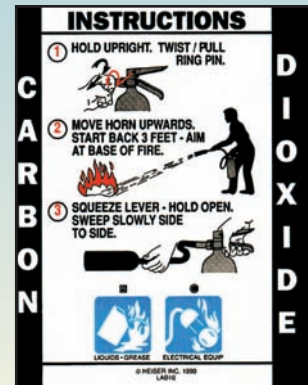
LAB10 CO 2 with Hose & Horn