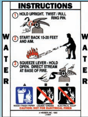
LAB04 Water with Hose