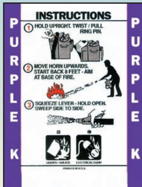
LAB13 Cartridge Operated Purple K