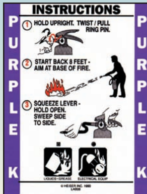
LAB08 Purple K with Hose