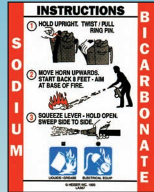
LAB07 Cartridge Operated BC