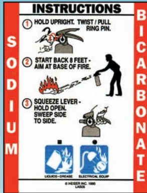
LAB05 BC with Nozzle