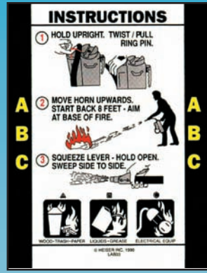
LAB03 Cartridge Operated ABC